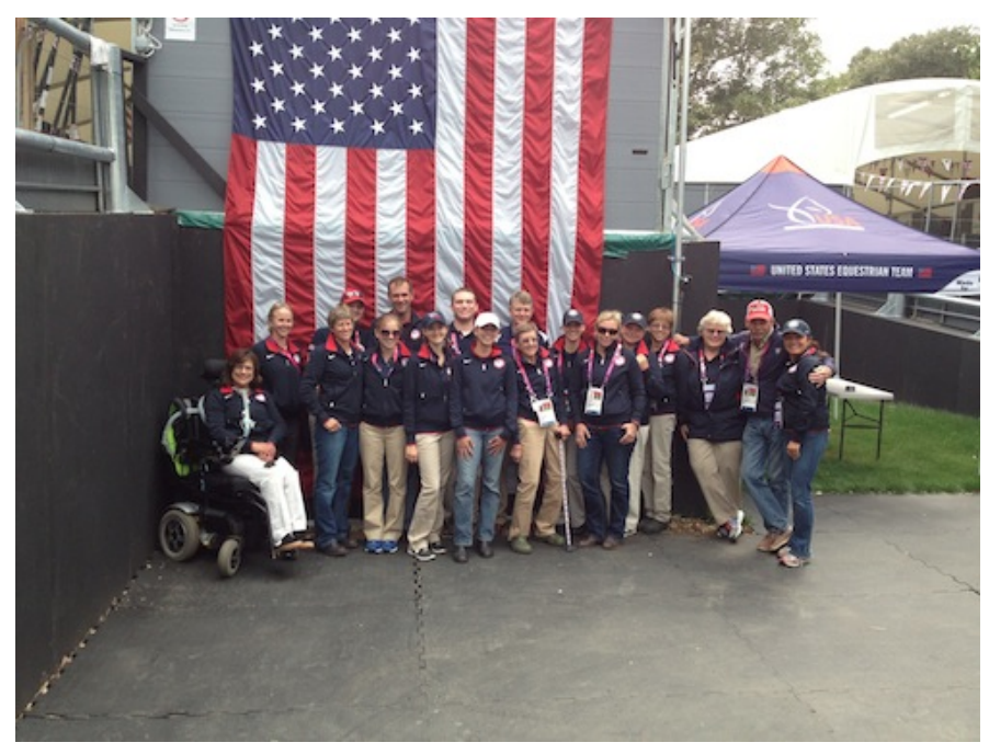
Team USA