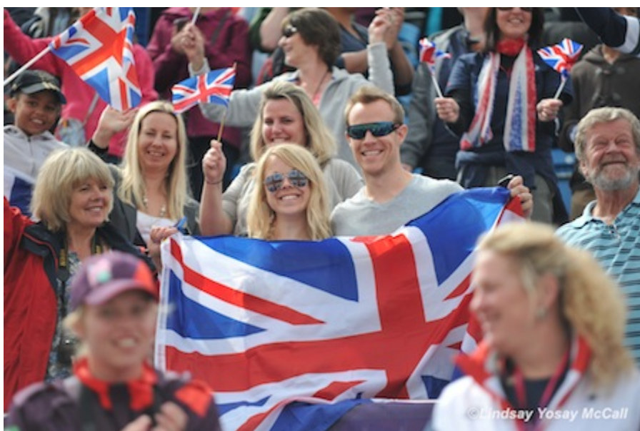
British Fans at the 2012 Paralympics