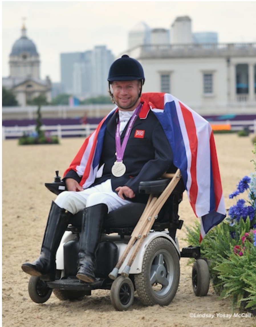
Gold Medalist Lee Pearson (GBR)