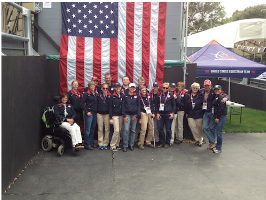
USA TEAM and Staff photo by Hope Hand