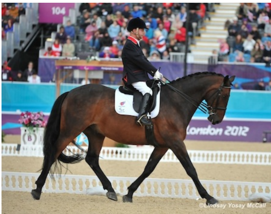
Lee Pearson (GBR) and Gentleman