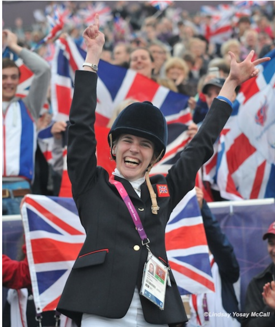
Sophie Christiansen (GBR)