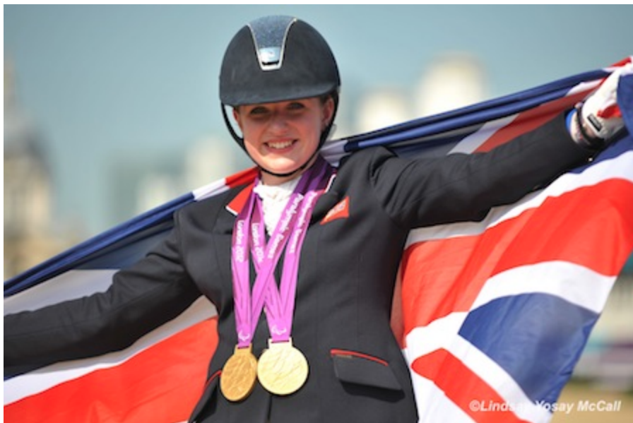
Natasha Baker (GBR) and her two gold medals